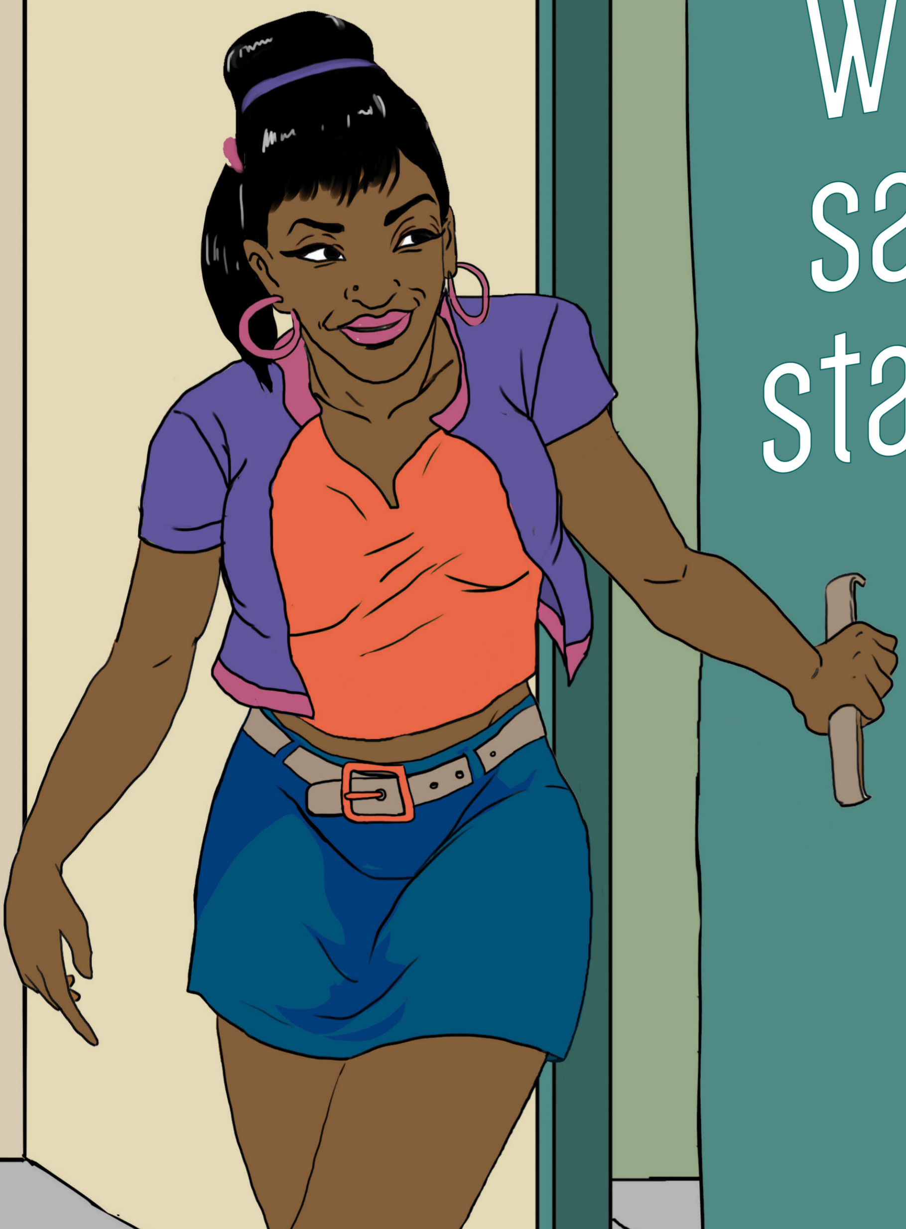
Illustration & Design - NoulherArt+ / MotoAction